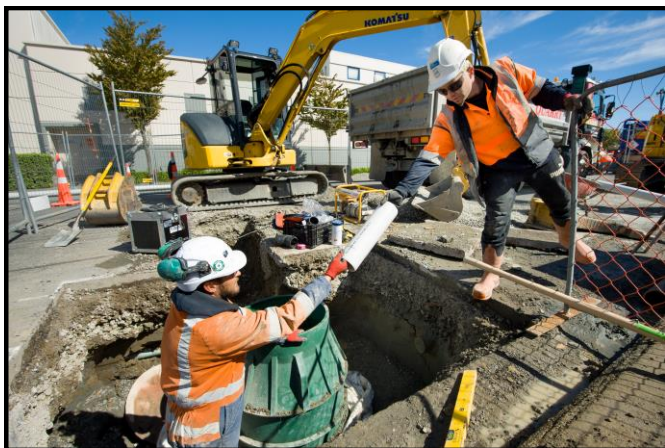
By design: Utilising contractors during project design has delivered multiple benefits.

Early constructor involvement (ECI) delivered maximum value through collaboration as SCIRT rebuilt the horizontal infrastructure of Christchurch.