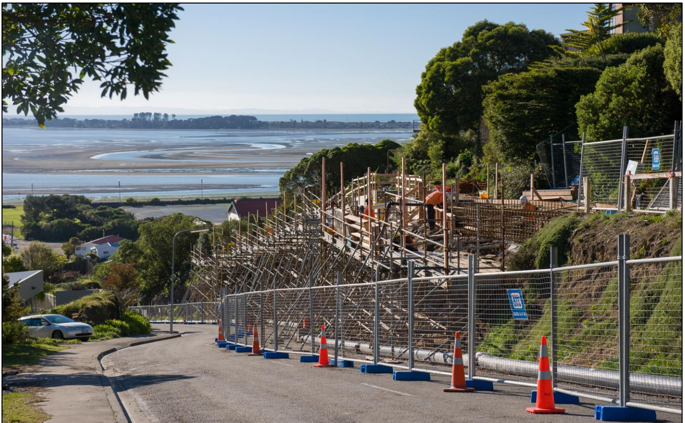
Rock and hold: ECI has been an important element in rock stabilisation projects in Mount Pleasant.

Overall, ECI opened the door to improved cost certainty on each project by significantly informing the estimate process. ECI involvement brought clarity, transparency and maximum value while heading off potential risks.