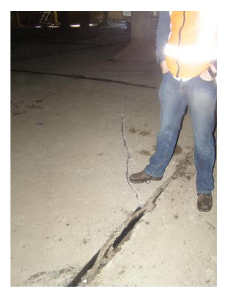
Figure 3: Dislocated Floor Slab Joint