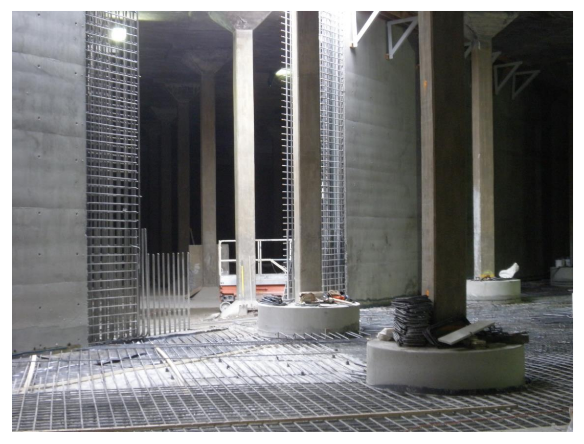
Figure 5: New Floor and Wall Sections under construction