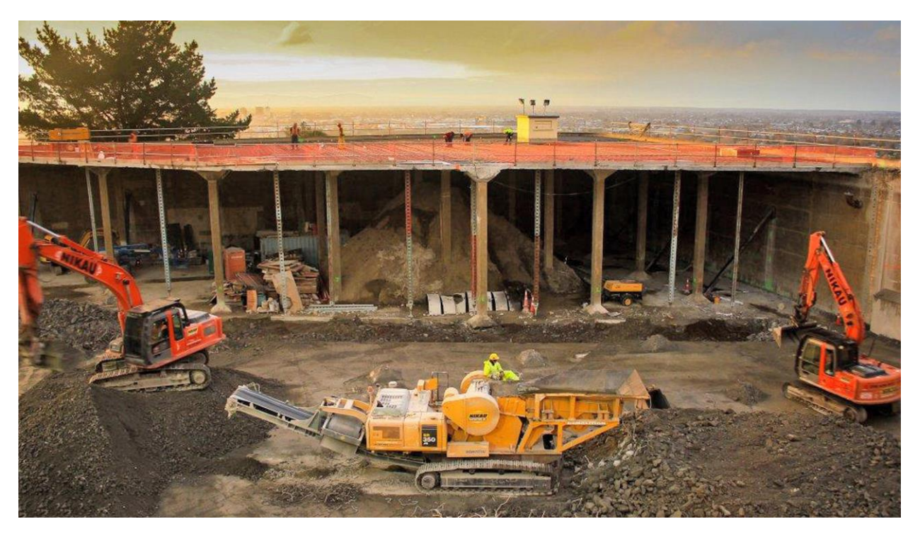
Figure 2: Huntsbury No 1 stage 2 reservoir - under construction