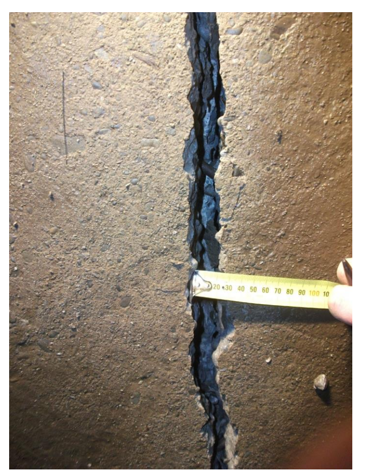
Figure 4: Crack in Floor Slab