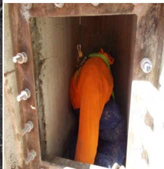
(2) Confined Space