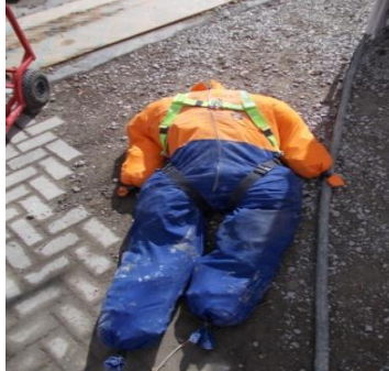
(1) Rescue Dummy